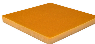
Soundfoam HTC w/ Kapton® Film (Polyimide)