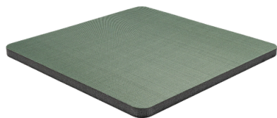
Soundfoam M w/ Nomex® Fabric (Polyether)

Soundcoat's absorptive noise control products can also provide hybrid solutions for dual acoustic functions of sound absorption and sound transmission loss. All Soundcoat acoustic foams are made to provide maximum absorption over a wide frequency range in minimum thickness. These foams absorb noise in everything from trucks and buses to semiconductor testing equipment, industrial buildings, and oxygen concentrators. Specific product details available via individual Technical Data Sheets. See all products listed on next page.