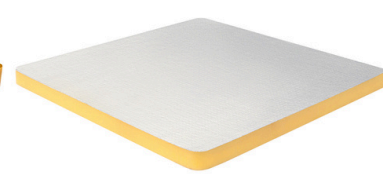
Soundfoam ML HY ULb w/ PEEK Film (Melamine)